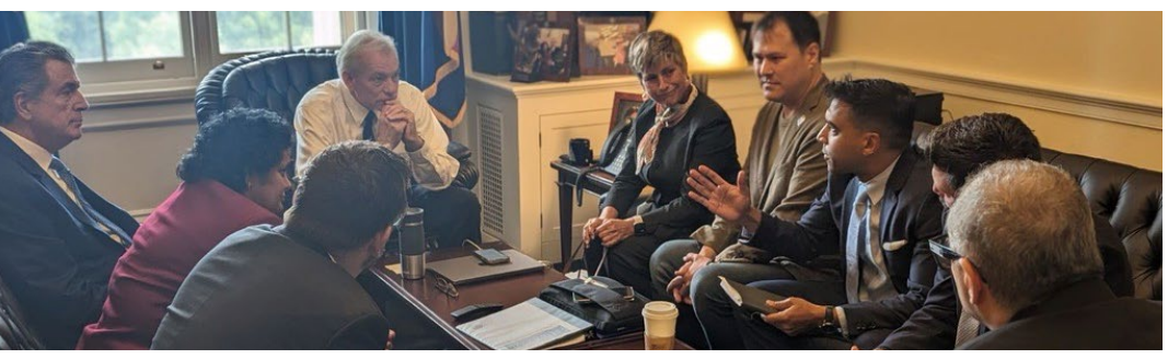
AdvaMed connected our board with influential policymakers, providing a platform for direct advocacy on medtech priorities.

Even as political pundits in January were already writing off 2024 as one of the least productive sessions of Congress in generations, the AdvaMed Federal Government Affairs team was strategically positioning the industry to secure long-sought victories in key sectors for our members.