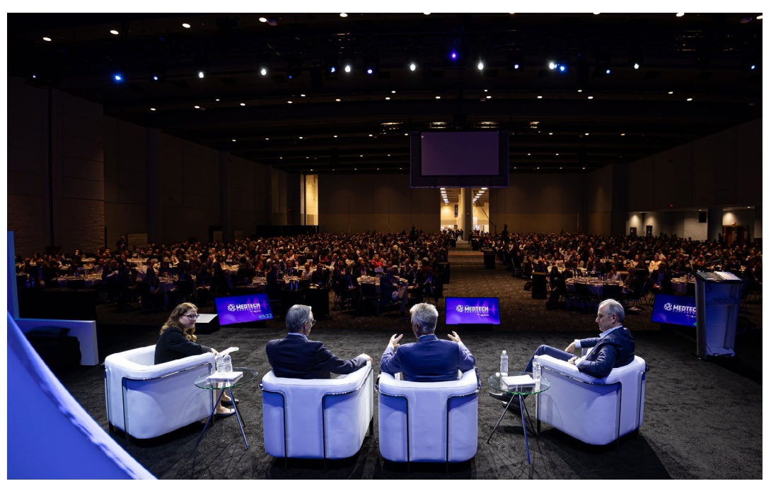
The MedTech Conference, 2024

AdvaMed's Conferences & Education offering has emerged from the Covid era stronger than ever, achieving remarkable success in rebuilding in-person engagement and attendance. This past year, AdvaMed hosted the largest MedTech Conference in our association's history, setting new records for participation – 25 percent larger than any previous conference – and showcasing the industry's resilience and innovation. Revenue from The MedTech Conference was $7.4 million.