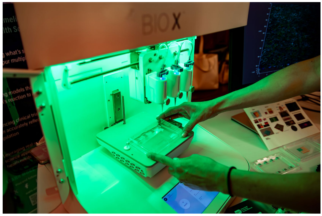
AdvaMed hosted the U.S. Senate AI Demo Day, which highlighted the latest AI technologies from several AdvaMed members, demonstrating the value of AI-driven advancements in medical imaging.

AdvaMed has fully integrated the Medical Imaging division into the organization, making it officially the largest organization with representation across all sectors of the medical technology field.